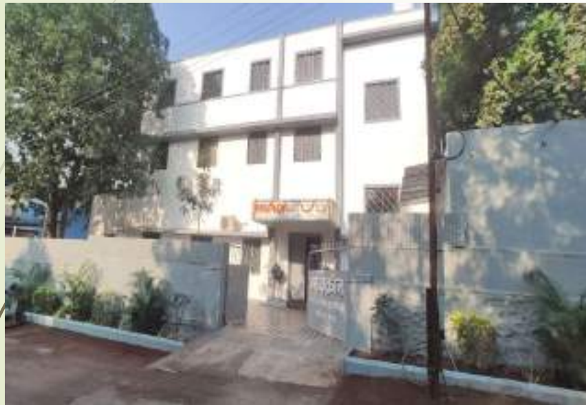
Unit – 1 19/8, F – 2 Block, MIDC Pimpri, Pune – 411 018.

(Specialized in all types of belt driven Spindles, Mandrils, Arbors, Jigs & Fixture, and Tool room activities)