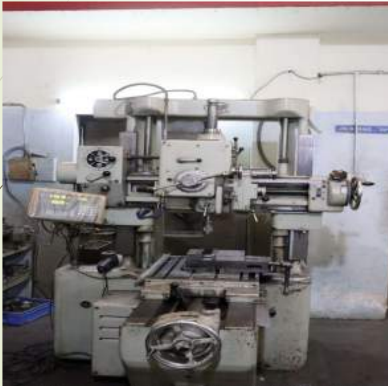
Make – Ship MK – 03 No. of M/C – 01 Nos