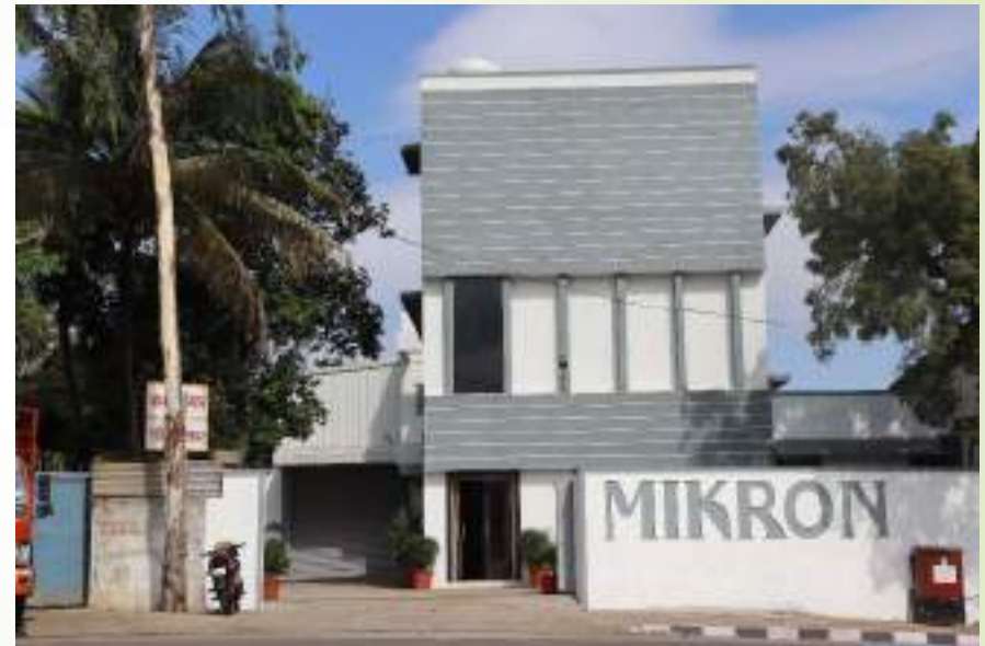
Unit – 2 30/3, F – 2 Block, MIDC Pimpri, Pune – 411 018.