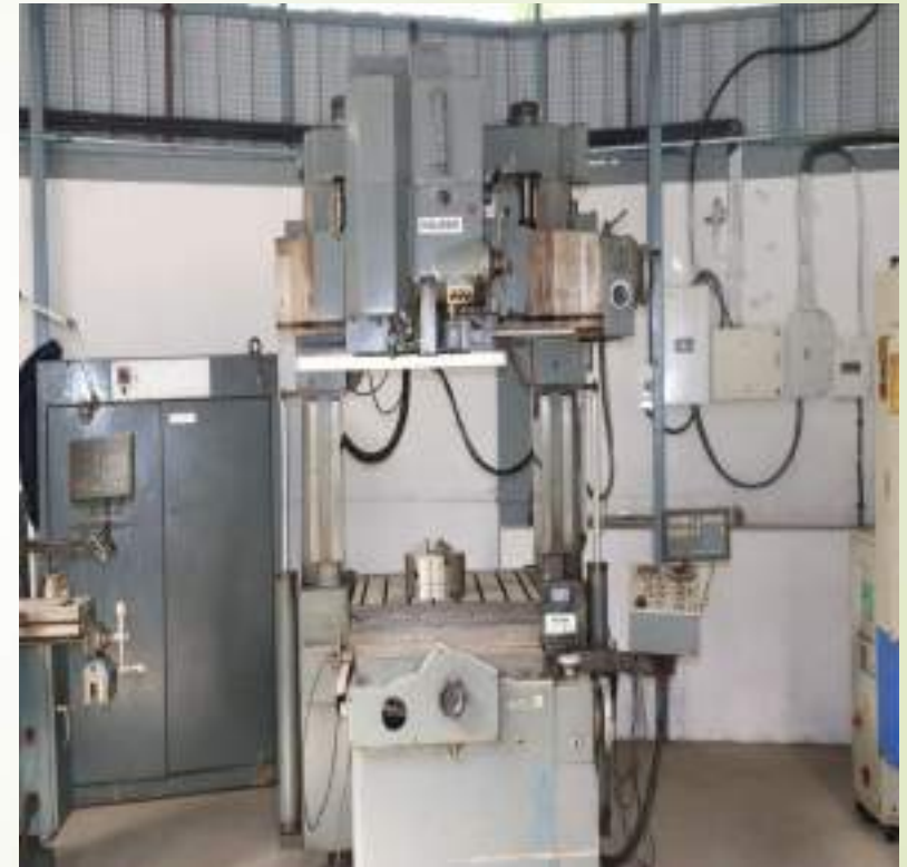
Make – HAUSER No. of M/C – 01 Nos